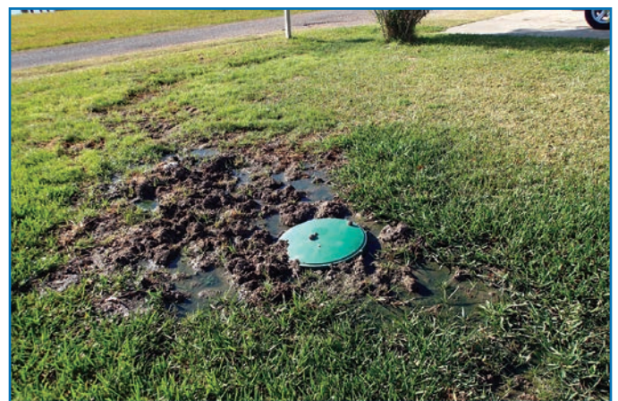
Figure 2. Surfacing effluent around a failing septic tank. Excessive vegetation, foul odors, stained soils, and saturated ground can indicate that the septic system is failing.

If your system is not maintained properly, it will malfunction (Fig. 2). Follow the maintenance instructions for the equipment installed for your system. A poorly designed, constructed, or maintained system can fail and return contaminated water to the surface of your property and to lakes, streams, and well water.