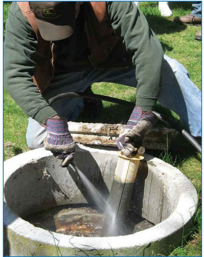
Figure 4. Cleaning an effluent screen over the inlet side of the tank. The riser installed on this tank allows quick access for maintenance activities.