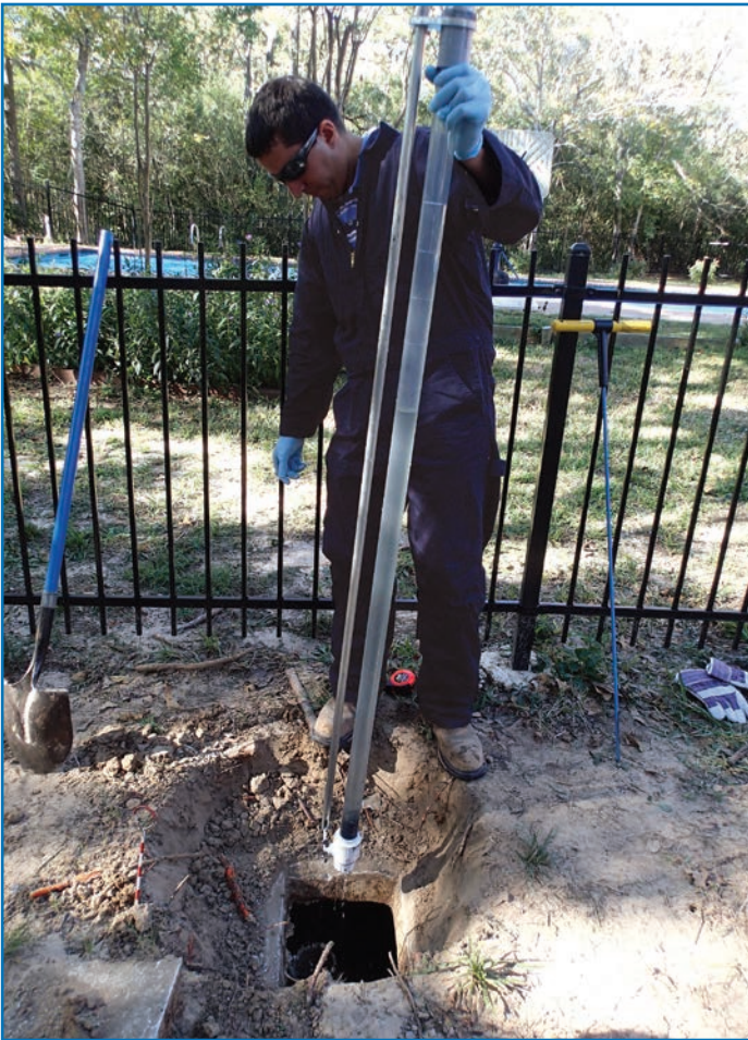
Figure 3. Inspecting scum and sludge layers inside the tank.

Follow these steps to help the microbes in the septic tank treat the wastewater properly: